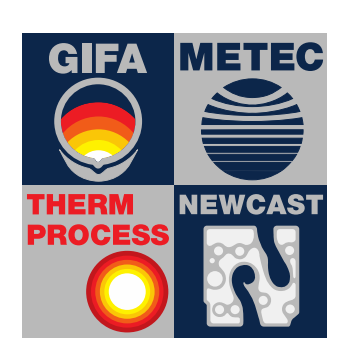
The Bright World of Metals