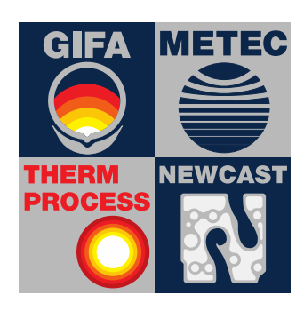
The Bright World of Metals