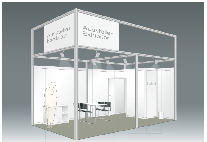
D2 Premium Package, 440.– EUR/m 2

The samples pictured here are available in either row or corner stand options.