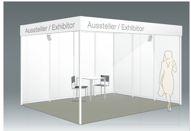
D1 Basic Package, 380.– EUR/m 2

Any waiver of individual company-specific or general services shall constitute no claim to reduction of the participation fee.