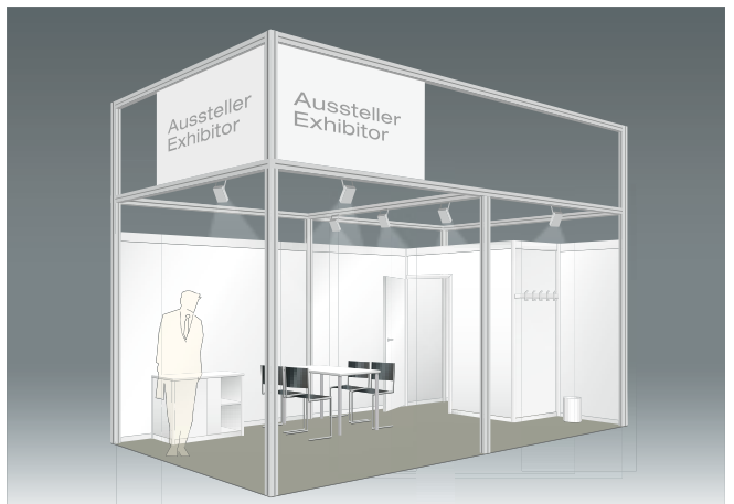
D2 Premium Package, 440.– EUR/m 2

The samples pictured here are available in either row or corner stand options.